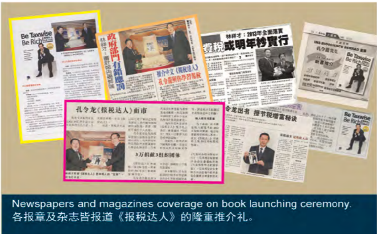
Newspapers and magazines coverage on book launching ceremony. 各报章及杂志皆报道《报税达人》的隆重推介礼。