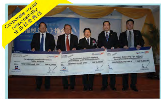
Limited "Golden" edition of the books were sold on the special day and collections were pledged towards three non-profit organisations. 推介礼上，我们也将当日所有售卖“精装”版的收益，捐赠于3大非盈利机构。