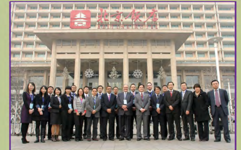
The representatives from all members firm have gathered in Beijing, China for annual board meeting, which was held in December 2011. 各成员所代表于2011年12月的董事会议，齐聚中国北京。