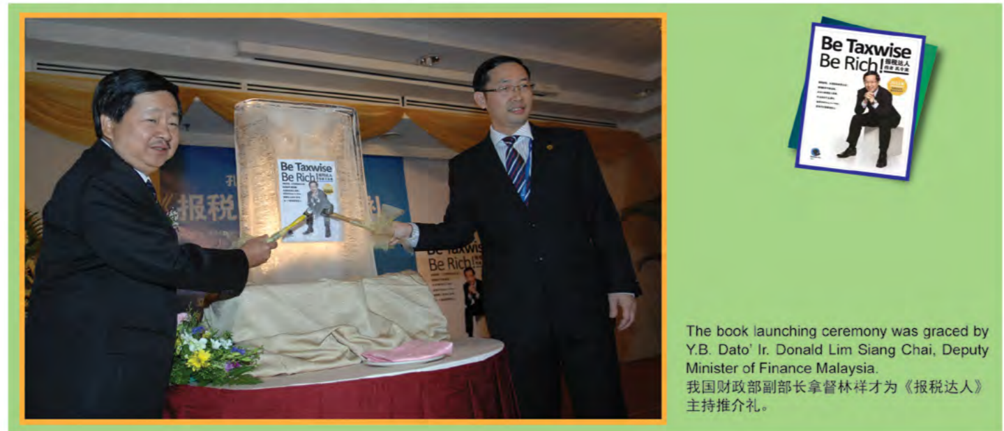
The book launching ceremony was graced by Y.B. Dato' Ir. Donald Lim Siang Chai, Deputy Minister of Finance Malaysia. 我国财政部副部长拿督林祥才为《报税达人》主持推介礼。